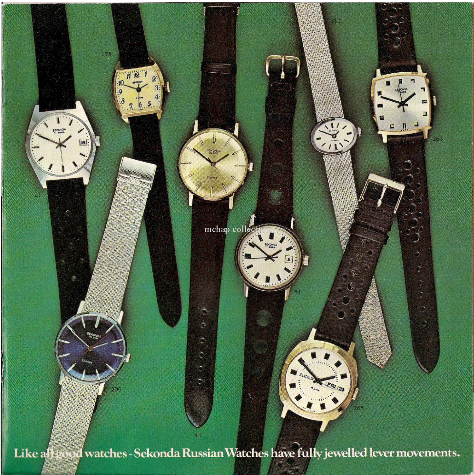
Like all good watches - Sekonda Russian Watches have fully jewelled lever movements.